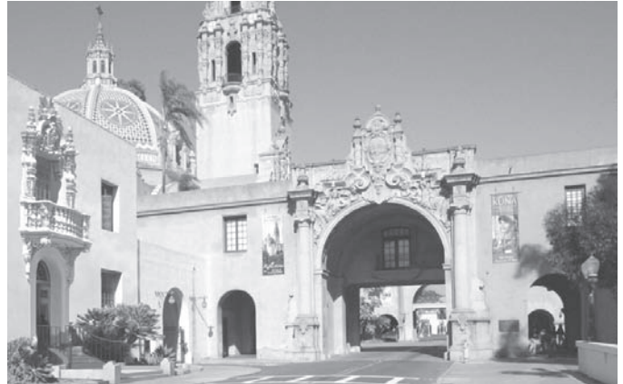
Ornamentation shown over doorway at far left

The original ornamentation has long been missing from the Prado entrance to this building, the first building completed for the 1915-1916 Panama-California Exposition. The Committee of One Hundred intends to restore it to its original condition. We have already begun preliminary renderings. The photo shows the missing ornamentation.