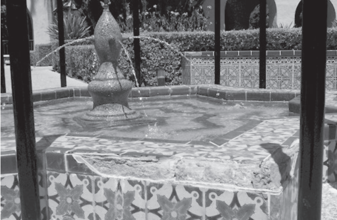
Damage to tile fountains in the Alcazar Garden