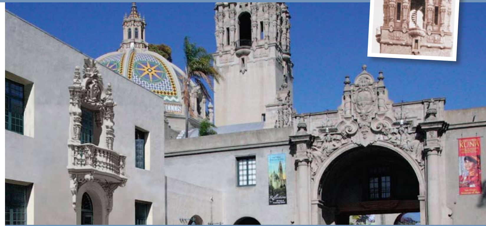
Simulation by Heritage Architecture and Planning