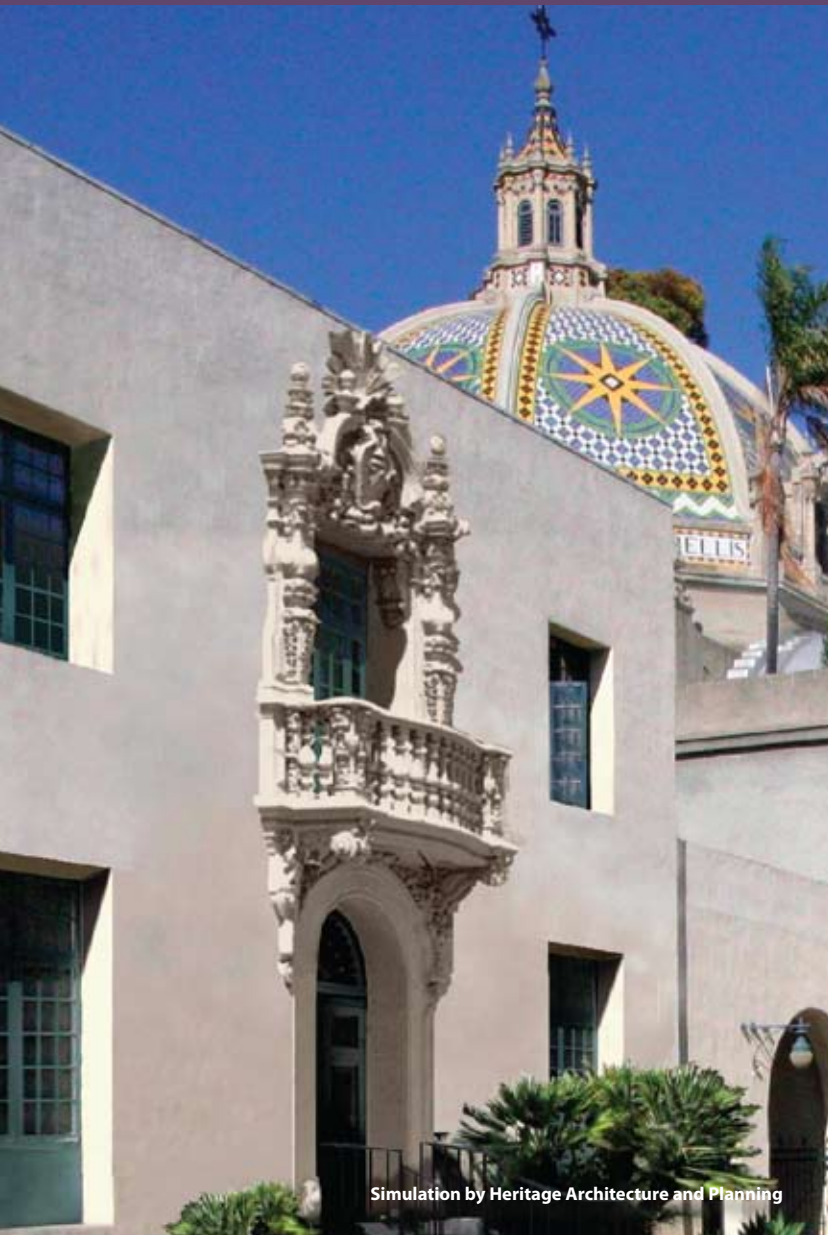
Simulation by Heritage Architecture and Planning