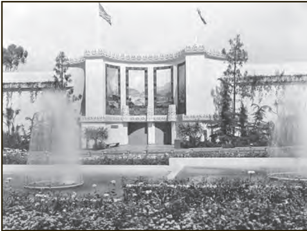
California State Building from Firestone Fountains, 1935

NONPROFIT ORG U.S. POSTAGE PAID SAN DIEGO, CA PERMIT #687