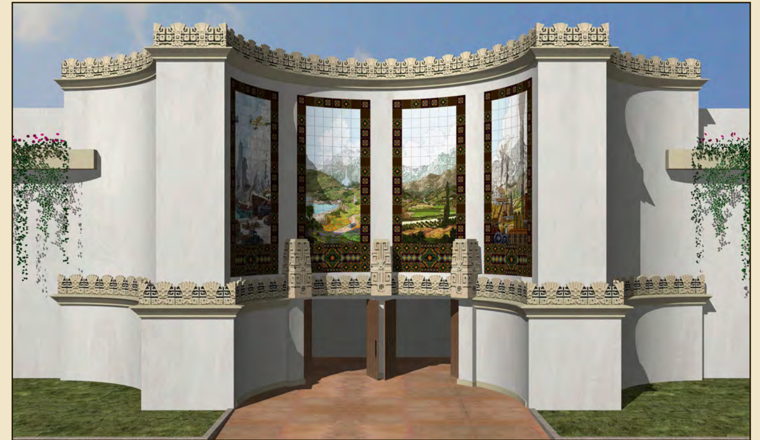
Illustration of restored building. © Robert Thiele Architect.

The Palisades area pleads for the attention it deserves as the core of our 1935 California Pacific International Exposition. By failing to maintain these once-proud historic buildings, the City of San Diego has allowed roofs to leak and damage collections; tree roots to damage floors and injure Park visitors; and ornamentation to go un-repaired while San Diego welcomes millions of tourists, and City and County residents to visit these buildings yearly. The City has completed a facilities assessment for each of these buildings. The City knows what needs to be done. It's time for our City to get to work.