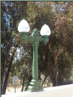
Restored Cabrillo Bridge lamp.

Walk, ride, or drive across the Cabrillo Bridge and you can't help but notice those recently restored lamps—thirty-one duplex lampposts installed in 1914 for the soon-to-open Panama-California Exposition.