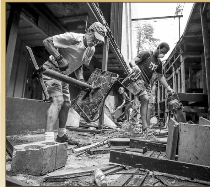
Volunteers clean up stage.

The Starlight Bowl, for many years home to the San Diego Civic Light Opera, is the venue where generations were entertained under the stars in