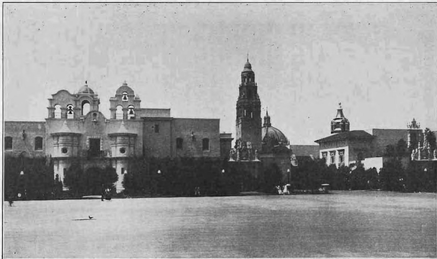
PLAZA DE PANAMA, AT SAN DIEGO.

This gives some idea of the effective grouping of buildings at the Panama-California Exposition. The dome and tower of the California Building dominate the group just as the New Museum Building will dominate the Santa Fe Plaza. The Science and Education Building, in the foreground, occupies the same relative position, architecturally, that the Palace of the Governors will at Santa Fe, upon the completion of the New Museum Building. Santa Fe's Plaza can be made as strikingly beautiful and harmonious as the Plaza de Panama at San Diego, especially, if the proposed Federal Building in "Santa Fe" style should go where the Griffin Block is now located, and the proposed tourist hotel on the site of the Fonda, while the buildings on the east side of the Plaza would make way for an extension of the public square to the Sanitarium and Cathedral grounds.