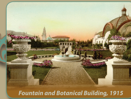
Fountain and Botanical Building, 1915