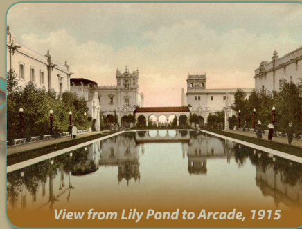
View from Lily Pond to Arcade, 1915